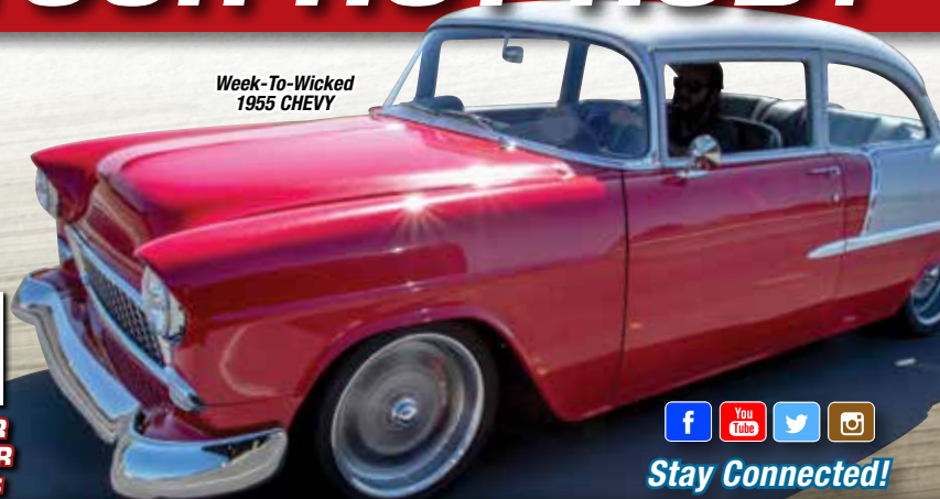
Week-To-Wicked 1955 CHEVY