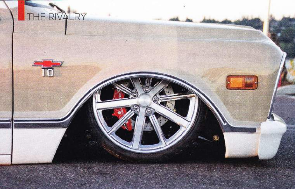
THE RACELINE CONTENDER BILLET WHEELS GIVE THIS CLASSIC C-10 A MODERN TOUCH.

“IT TOOK THREE SETS OF ORIGINALS TO CREATE THE [WHEEL COVERS] ON HIS TRUCK. TAN-AND-WHITE PAINT GIVES THE TRUCK A CLASSIC APPEARANCE, AND A SET OF 22-INCH RACELINE CONTENDER WHEELS COMPLETES THE MEAN LOOK OF THE LOW-SLUNG C-10.”