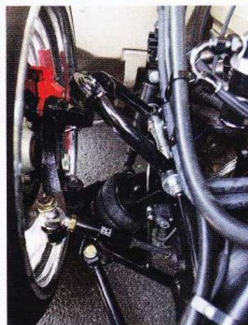
BROOK'S TRUCK SCRAPES THE PAVEMENT THANKS TO COMPONENTS FROM CLASSIC PERFORMANCE PRODUCTS, PORTERBUILT FAB AND SLAM SPECIALTIES.