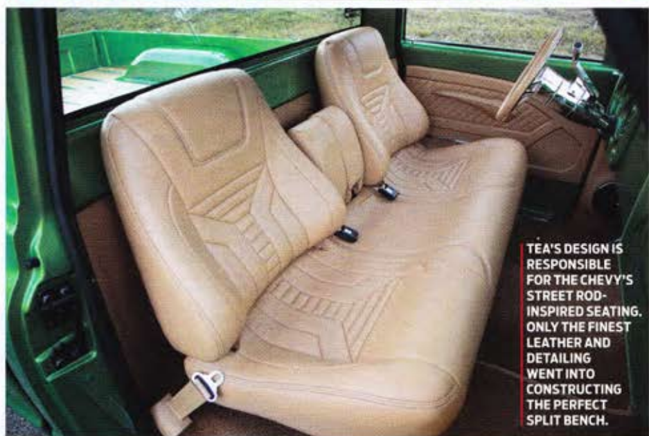
TEA'S DESIGN IS RESPONSIBLE FOR THE CHEVY'S STREET ROD-INSPIRED SEATING. ONLY THE FINEST LEATHER AND DETAILING WENT INTO CONSTRUCTING THE PERFECT SPLIT BENCH.